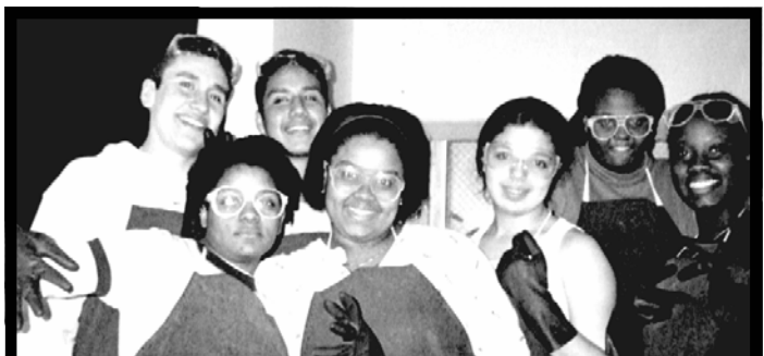
city links students learning to make holograms at the mit museum

CITY LINKS IS AN INTERNSHIP PROGRAM FOR IMMIGRANT STUDENT WHO NEED TO GET USED TO AMERICAN LIFE AND IT' LL GIVE YOU A DOZEN OF EXPERIMENT. CITY LINKS HAVE BEEN AROUND FOR YEARS AND HAVE A LOT, LOT, LOT OF STUDENT AND MANY HAVE ALREADY GRADUATE FROM HIGH SCHOOL. IN CITY LINKS STUDENTS HAVE A LOT OF FUNZZZZZ.