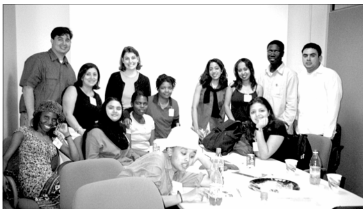
CITY LINKS VISITS TEADYNE CORPORATION.