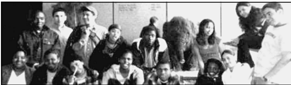
CITY LINKS FIELD TRIP AT THE BOSTON MUSEUM OF SCIENCE

What do teenagers want? This is a very interesting question and I don't think there is one answer to this question in general. In this case I asked some teenagers and they all gave me different answers, but the main idea is "they all want to be independent." What I mean about this is they don't want their parents to tell them what to do or not do. They want to do whatever they want. Sometimes I would like to be independent myself, however I have a limit, because when I look around the school and the kids in it, I see what's happening because of bad influences, so I would rather have limits and have my parents tell me what to do. But not everyone was thinking of independence, I asked some bilingual student the same question, and I found that almost all of them were thinking about school and getting an education, which I thought is great.