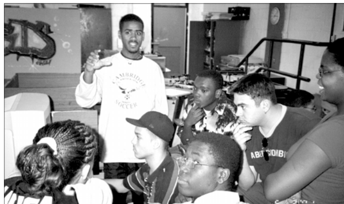
CITY LINKS STUDENTS COLLABORATE DURING WEB DESIGN CLASS.