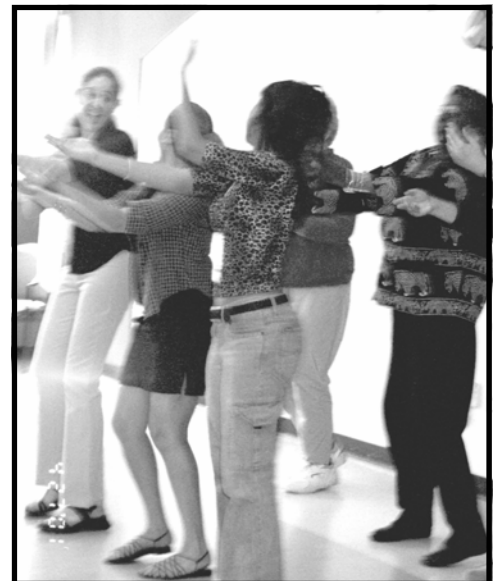
City Links students teaching the Macarena to the seniors at the Cambridge Senior Center.