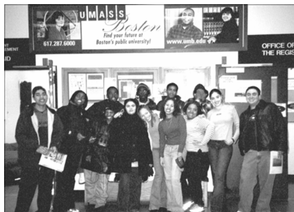
CITY LINKS VISITS UMASS BOSTON.

X-MEN: Good action movie even though it is missing some characters and the whole concepts of the comic book story. It is fun for the whole family.